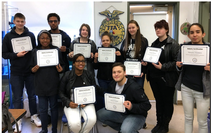
Elanco Veterinary Medical Applications Certification earners.