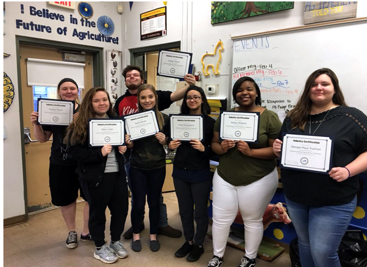
Seneca students receive their industry certifications.

According to the Association for Talent Development (ADT) , it costs an average of $1,252 to train a new employee. Combined with the financial investment, employers invest an average of 33.5 hours in employee training. Research also shows the less prepared an individual is for the position's job requirements; the more likely they are to leave the company. The Society of Human Resource Management indicated nearly 40 percent of employees who leave their positions do so within the first 12 months of employment. A study from the Center for American Progress reported, on average, a company will spend 21 percent of an employee's salary to find a replacement. As indicated by these statistics, if an individual is well-trained and prepared for their field of interest, they are more likely to secure employment and be successful in that position, saving them and their employer time and money.