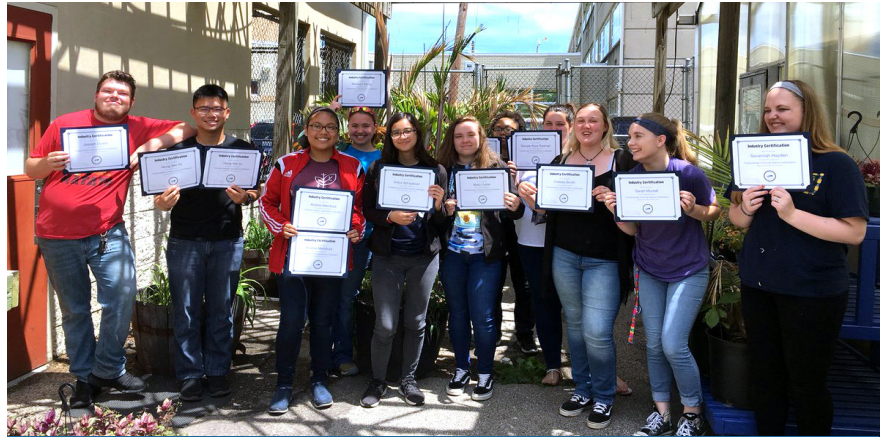
Seneca students proudly display their industry certifications.